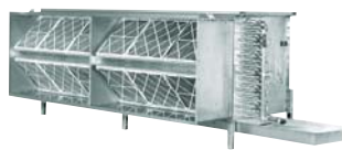
Draw Through Coils with Inlet Air Filters