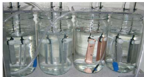
Exhibit "A" Immersion Test Apparatus

The primary test designed for this study utilized each of the cleaning solutions listed in Table I and each of the sanitizers listed in table II. The selected cleaning solutions and sanitizers were evaluated for each material of construction through a series of immersion tests conducted with corrosion coupons. Exhibit "A" shows the typical immersion test apparatus used in the study.