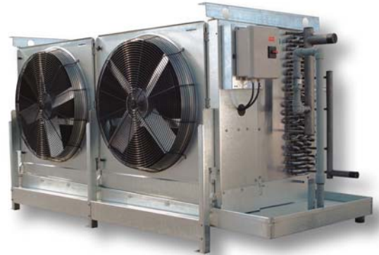
STM - Cooler & Freezer Units

The study presented in this bulletin provides a comprehensive laboratory test performed by EVAPCO which was designed to analyze the effects of the leading cleaners and sanitizers on common materials used in the manufacture of evaporator coils applied in today's industrial refrigeration systems.