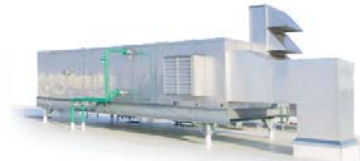
Critical Process Air Systems®