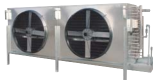
STL Product Coolers