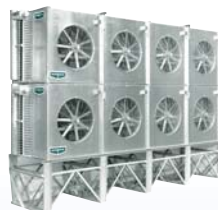
Stacked Blast Freezer Evaporator