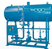
MRP Recirculator Systems