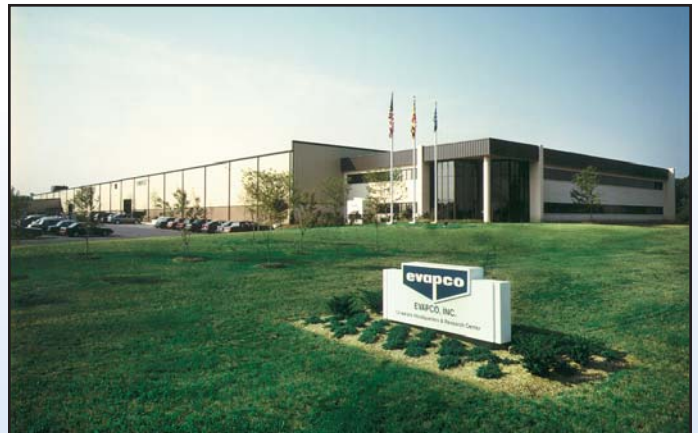
World Headquarters & Research/Development Center, Taneytown, MD