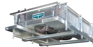
STD Low Profile Coolers