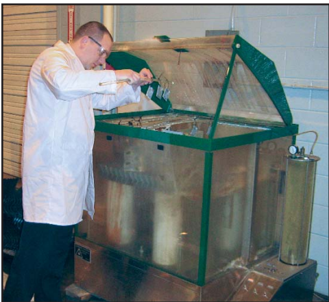
EVAPCO technician inspects material samples

field operating conditions and improve the service life of EVAPCO products.