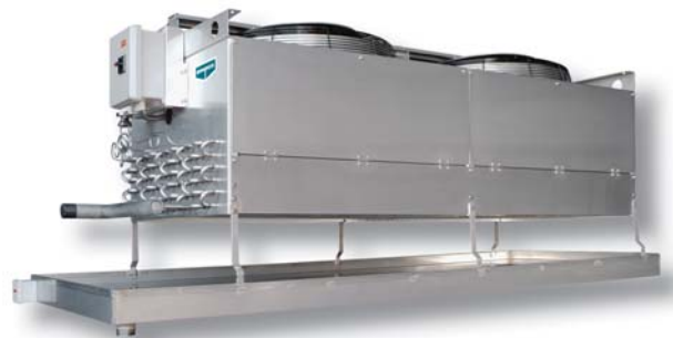
STW - Work Room Units

Laboratory tests confirm that many of the cleaning solutions and sanitizer compounds which are commonly used in the industrial refrigeration industry are compatible with Stainless Steel - Aluminum Fin coils as well as other traditional coil materials. The assumption that only Hot-Dip Galvanize coils are compatible with cleaning and sanitizer solutions has been proven to be OLD and FALSE!