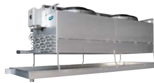
STW Workroom Units