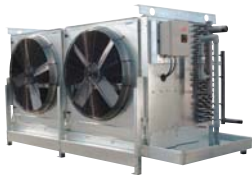
STM Unit Coolers