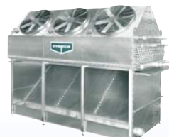
Spiral Blast Freezer Evaporator